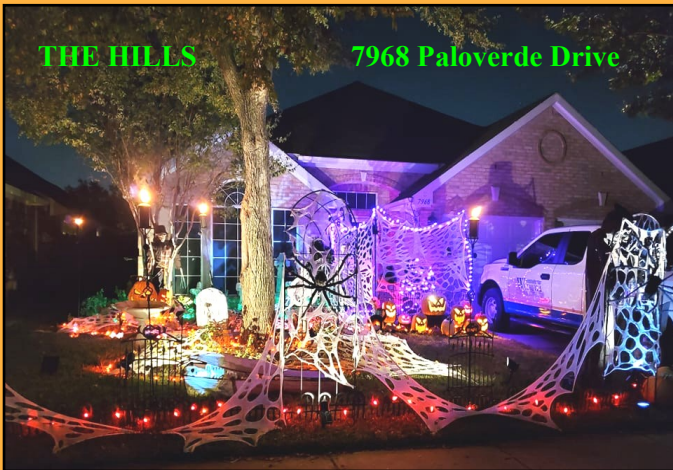
7968 Paloverde Drive