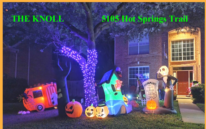
THE KNOLL 5105 Hot Springs Trail