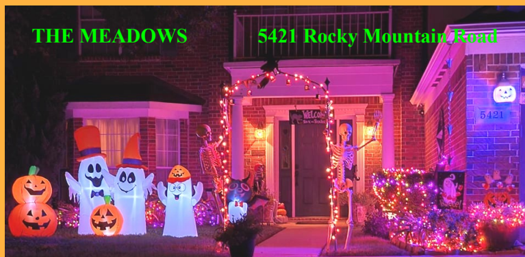
THE MEADOWS 5421 Rocky Mountain Road