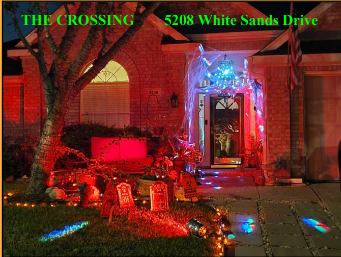
THE CROSSING 5208 White Sands Drive