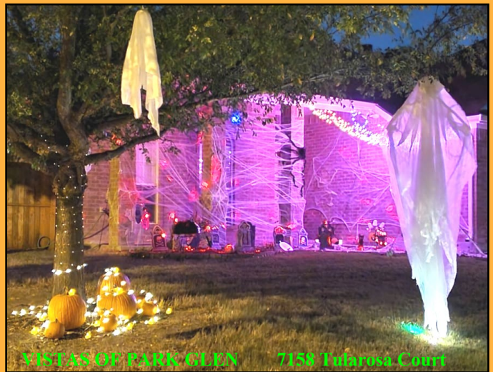
VISTAS OF PARK GLEN 7159 Tudorosa Court