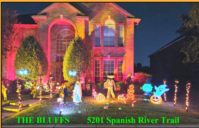
THE BLUFFS 5201 Spanish River Trail