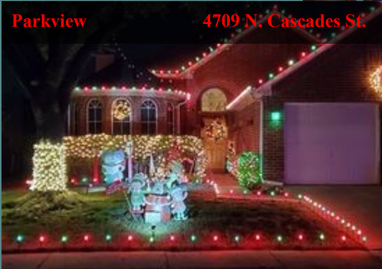
4709 N. Cascades St.