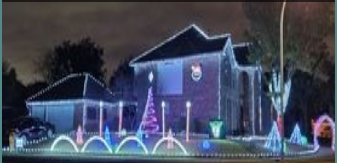
8301 Greylock Dr.