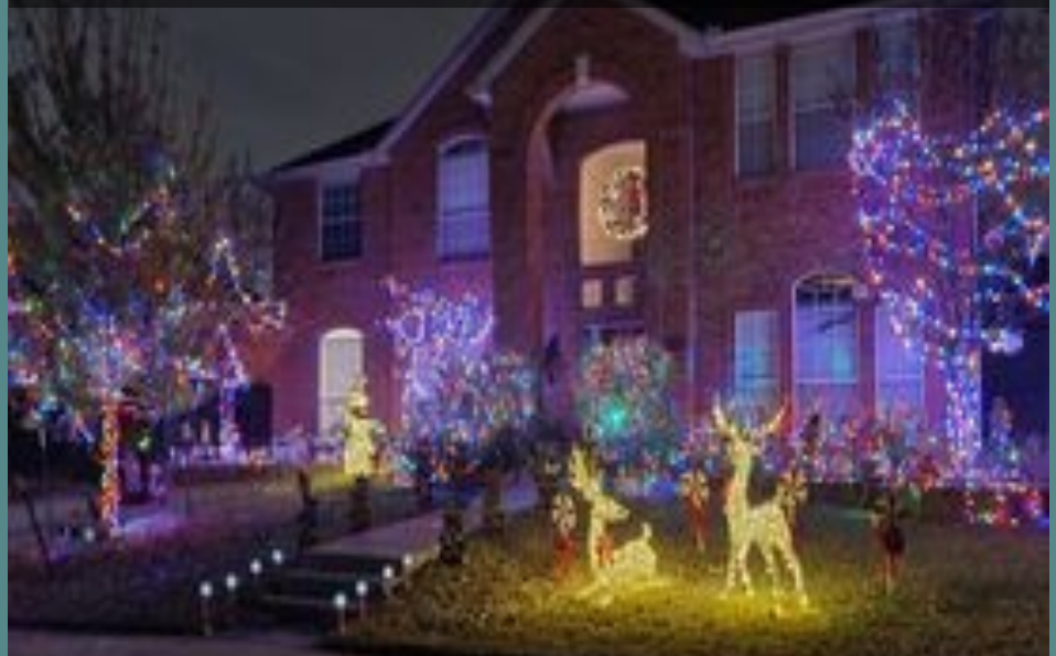
8005 Rushmore Rd.