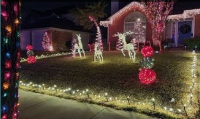
5409 Bryce Canyon Ct.