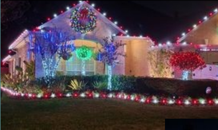
7055 Deer Ridge Dr.