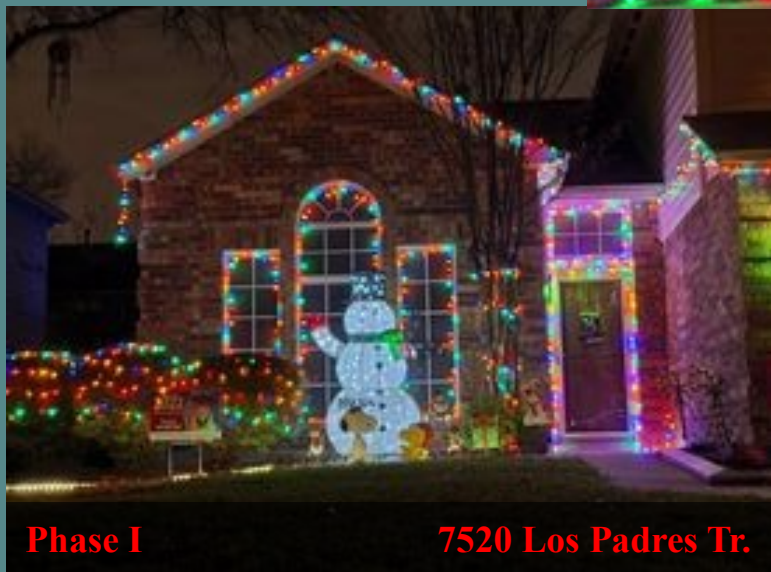
7520 Los Padres Tr.