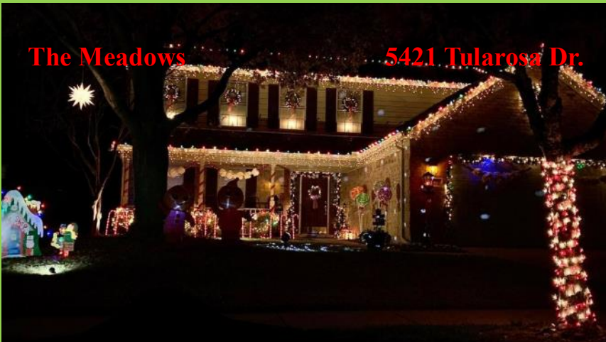
5421 Tularosa Dr.