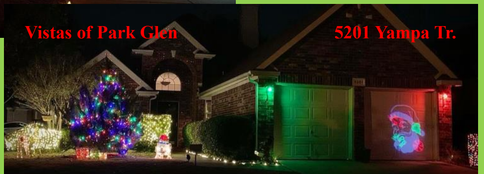
Vistas of Park Glen