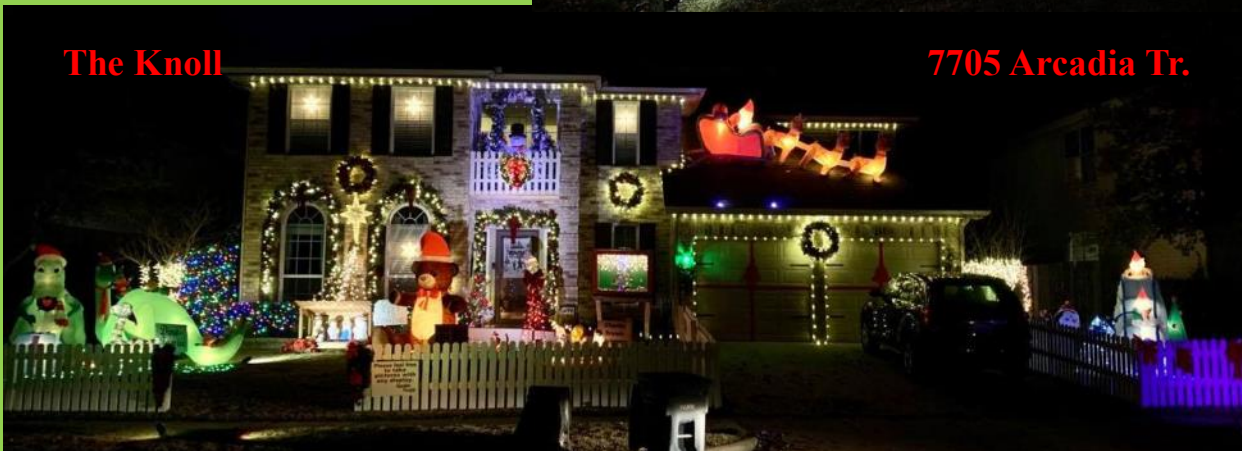
7705 Arcadia Tr.