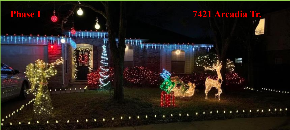
7421 Arcadia Tr.