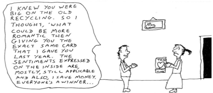
A tip to Husband's, boyfriends, all members of the male gender, the above scenario never ends well...