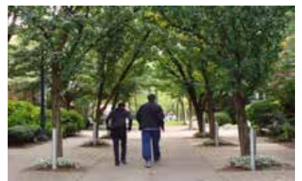
5. LINKED TRAILS