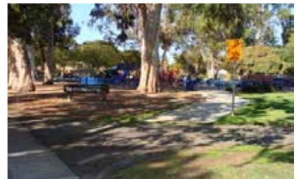
4. Shaded Parks & Playgrounds