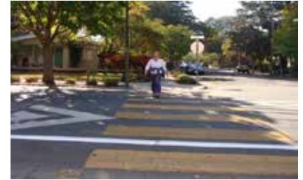
2. SAFE & SHADED WALKABLE STREETS