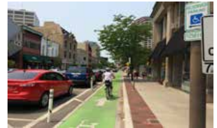
3. Safe Bike Lanes