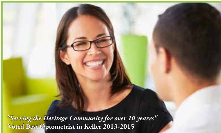
"Serving the Heritage Community for over 10 years" Voted Best Optometrist in Keller 2013-2015

Helping you look and see your best Call today to schedule an appointment.