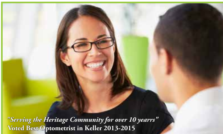
"Serving the Heritage Community for over 10 years" Voted Best Optometrist in Keller 2013-2015