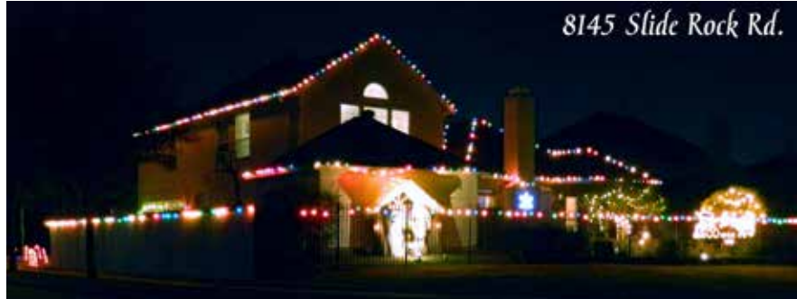
8145 Slide Rock Rd.