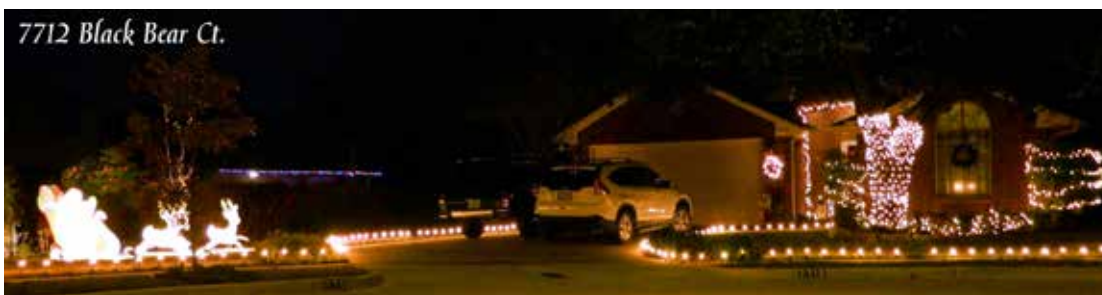
7712 Black Bear Ct.