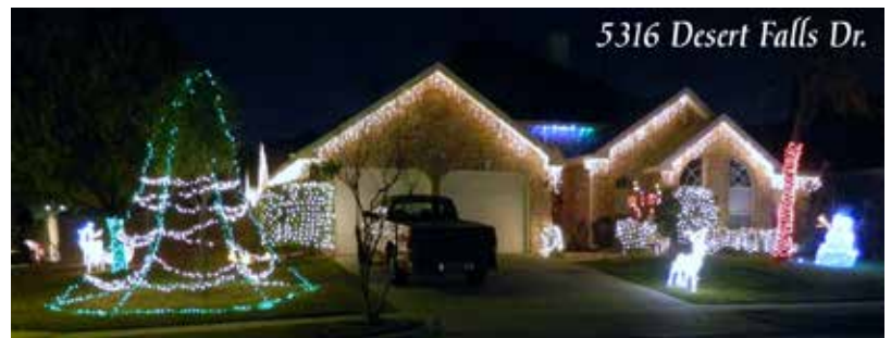
5316 Desert Falls Dr.