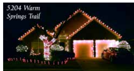
5204 Warm Springs Trail