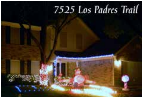
7525 Los Padres Trail