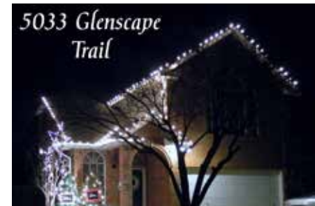
5033 Glenscape Trail