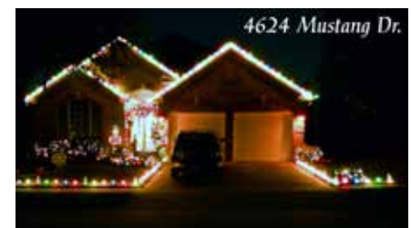
4624 Mustang Dr.