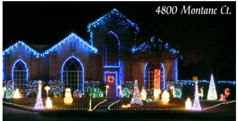
4800 Montane Ct.

Congratulations to all of our 13 village winners! You guys did an amazing job on your yards and homes! There were so many great decorations this year that it was hard for the judges to pick the winners. Thanks for lighting up Park Glen this year!