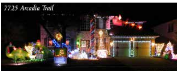
7725 Arcadia Trail