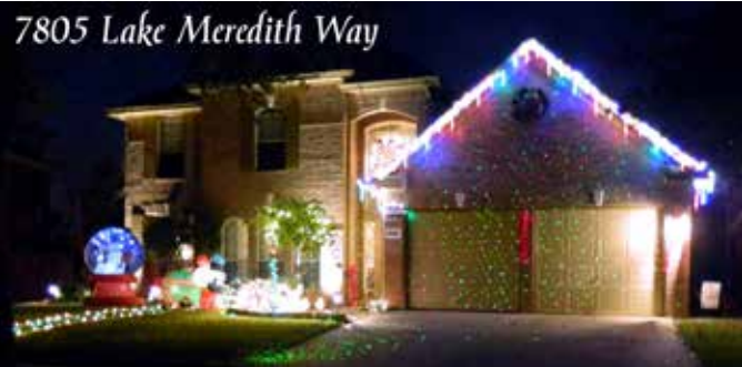
7805 Lake Meredith Way