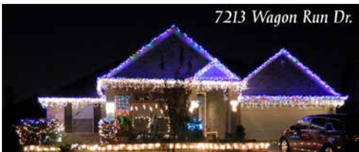
7213 Wagon Run Dr.