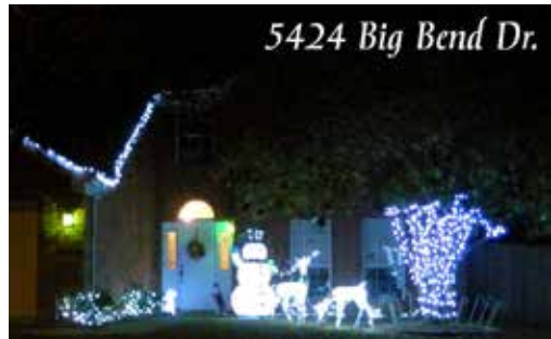
5424 Big Bend Dr.