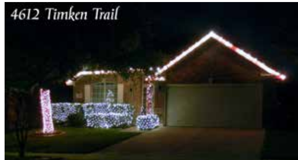
4612 Timken Trail