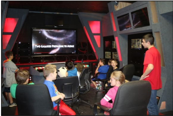
Commanding a fleet of Spaceships from our Starship Bridge!