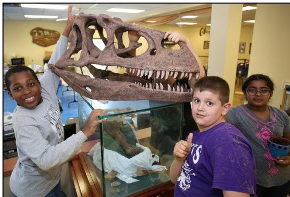
Bringing Geology and Paleontology to life!