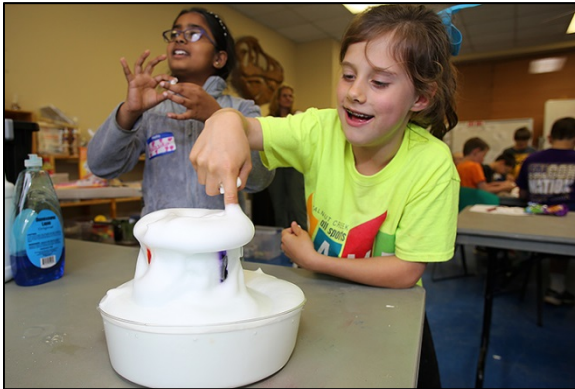
Sometimes Science boils over in the Blue Room!