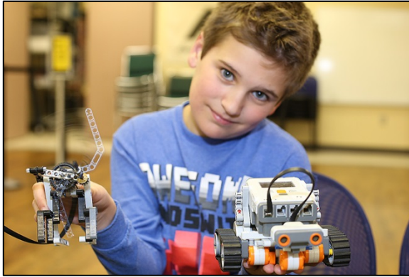
Building a robot!