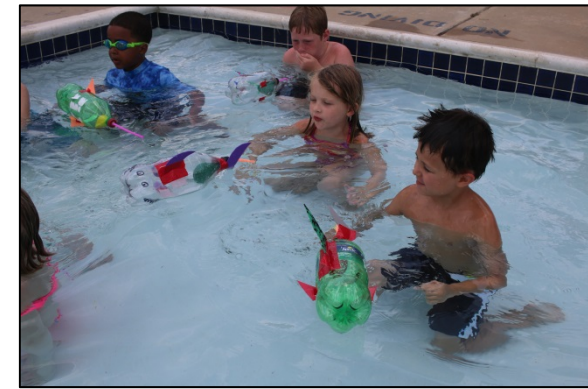
Swimming every day for 1.5 hours! Swim Lessons included.