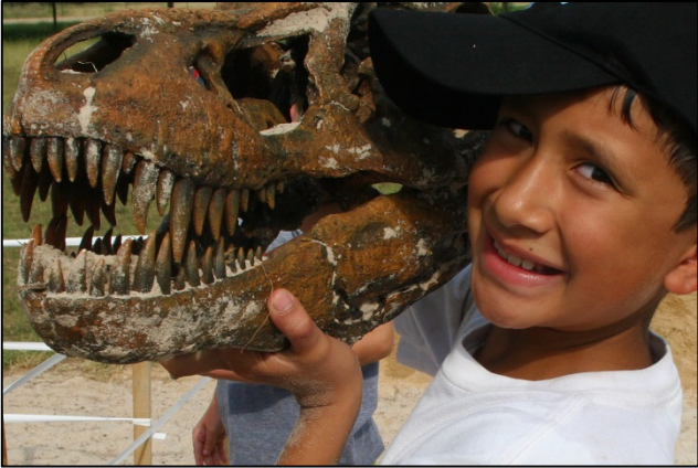
Dig up our 32 foot Allosaurus skeleton and many more dinosaurs!!