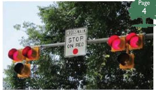
Example of PHBs mounted on a mast arm.

The application and guidelines will be available at www.ParkGlen.org on April 24. Applications may be submitted between May 1 and June 1. It will be a 3-page application that calls also for 2 letters of recommendation and a recent transcript. This scholarship program is for college or university study in the fall 2020 semester and is NOT just for high school seniors.